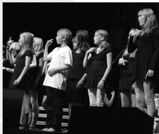
Hearts-in-Harmony 2008, Trondheim (NO)