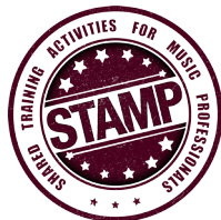
EUROPA CANTAT 2006 Mainz

Co-funded by the Creative Europe Programme of the European Union